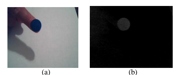
Figure2. (a) Input image, (b) after using imsubtract and detect the blue color

The array returned, Z, has the same size and class as X unless X is logical, in which case Z is double